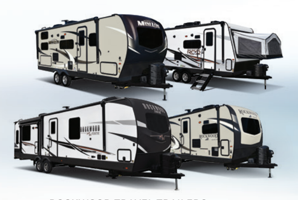
ROCKWOOD TRAVEL TRAILERS