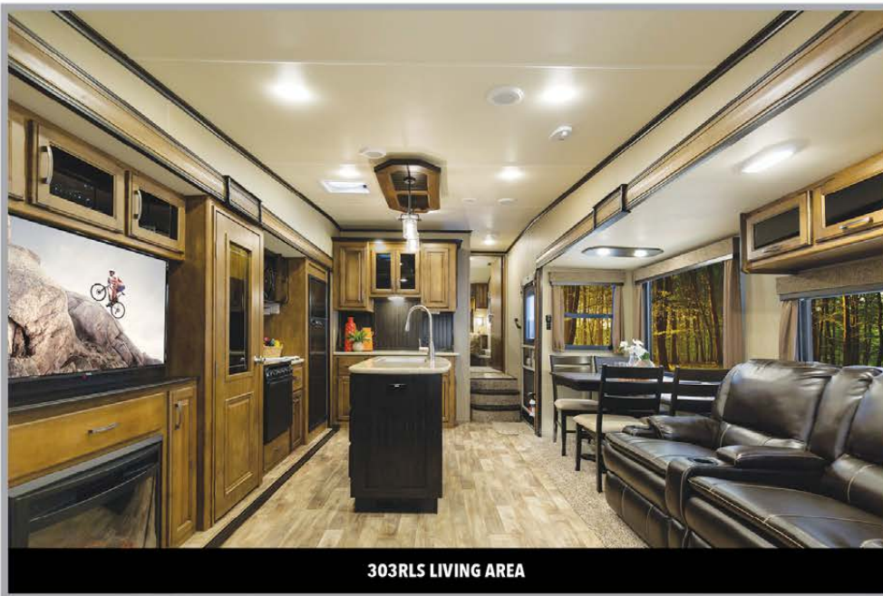
303RLS LIVING AREA