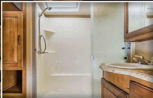
Spacious Master Bath (Bed slide models shown)

Reflection's combination of luxury, value, and towability in one amazing package continues to exceed the expectations of our retail customers. Our industry leading pursuit of quality and commitment to building around the needs of our retail customers is what drives Reflection to the top of its class.