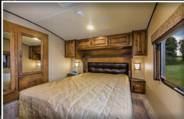
Residential Master Suite (Wardrobe slide models shown)