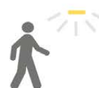
MOTION SENSOR LED LIGHTING No more searching for light switches in the dark.