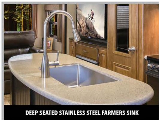
DEEP SEATED STAINLESS STEEL FARMERS SINK