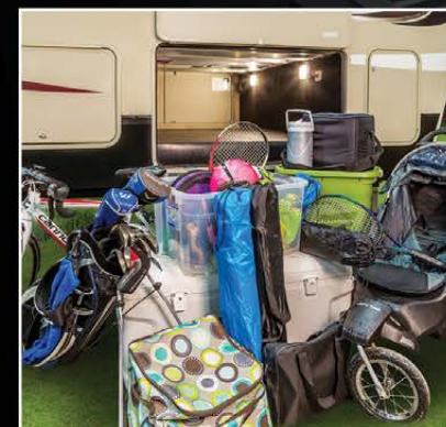
UNOBSTRUCTED PASS THRU STORAGE Clean storage area with slam latch baggage doors and magnetic catches.