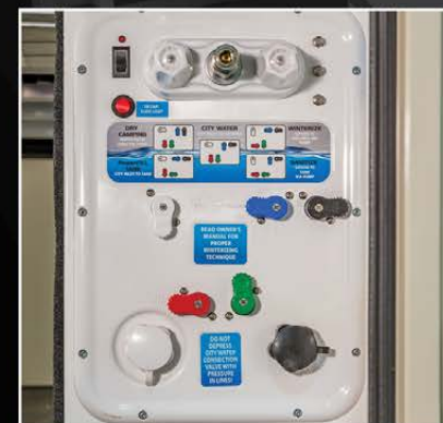
UNIVERSAL DOCKING STATION All-in-one heated location with EZ winterization system with exclusive siphon feature (Fresh tank)