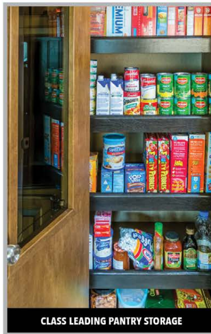
CLASS LEADING PANTRY STORAGE