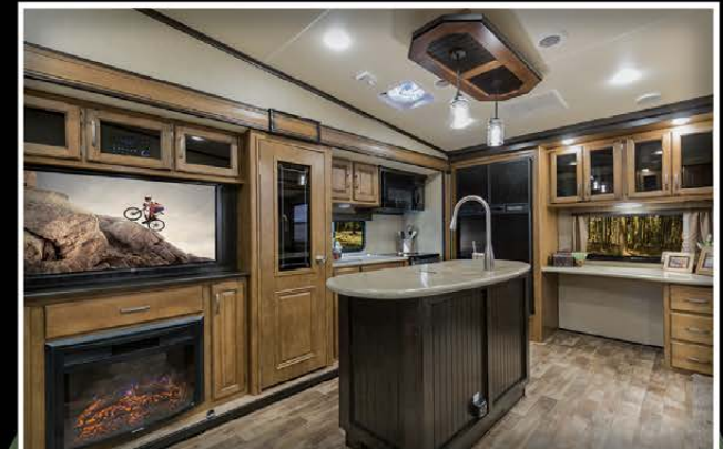
Gourmet Kitchen (307MKS shown)