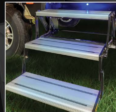
ALUMINUM ENTRY STEPS 100% Aluminum, easy open... won't rust or bind.