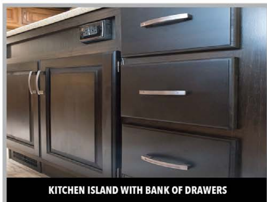
KITCHEN ISLAND WITH BANK OF DRAWERS