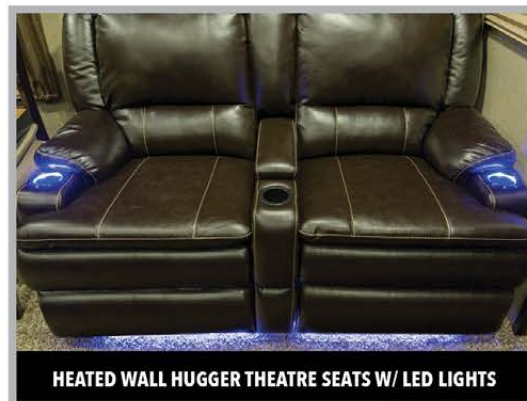
HEATED WALL HUGGER THEATRE SEATS W/ LED LIGHTS