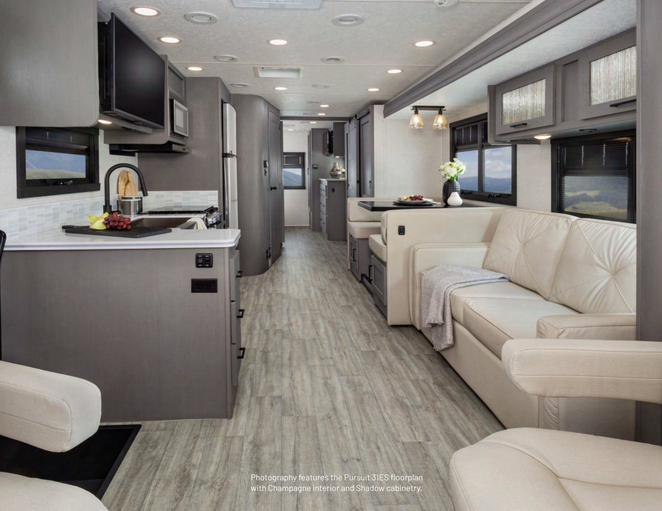
Photography features the Pursuit 31ES floorplan with Champagne interior and Shadow cabinetry.