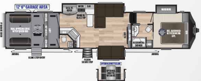
429 L-shaped sofa, 1 1/2 bath, 12' 6" garage, triple-axle Weight: 15385 LBS. | Length: 44' 0"