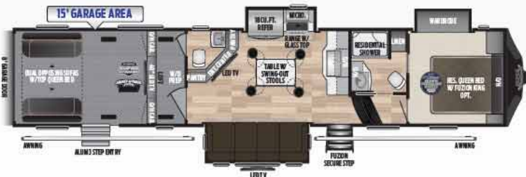
419 Island kitchen, swing out stools, 1 1/2 bath, 15' garage, triple-axle Weight: 15240 LBS. | Length: 44' 0"