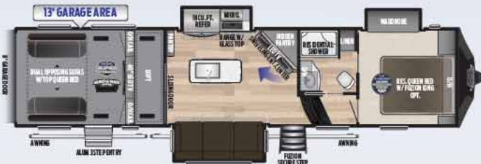
357 Island kitchen, hidden pantry, 13' garage, tandem-axle Weight: 13650 LBS. | Length: 39' 0"