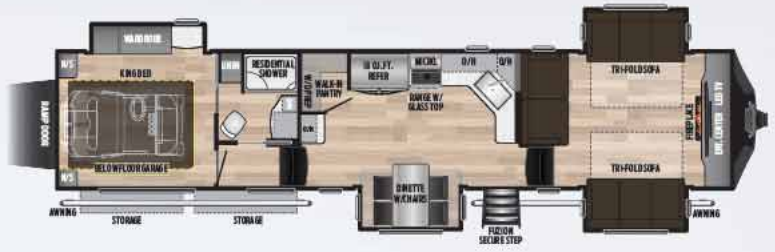
410 New front living, 110'x63' toy box, triple-axle Weight: 14475 LBS. | Length: 43' 7"