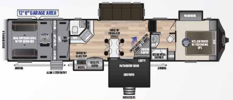
424 Side patio, 1 1/2 bath, 12' 6" garage, triple-axle Weight: 15860 LBS. | Length: 43' 6"