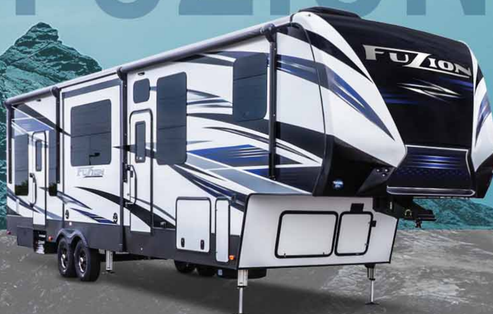
FUZION | TOY HAULERS