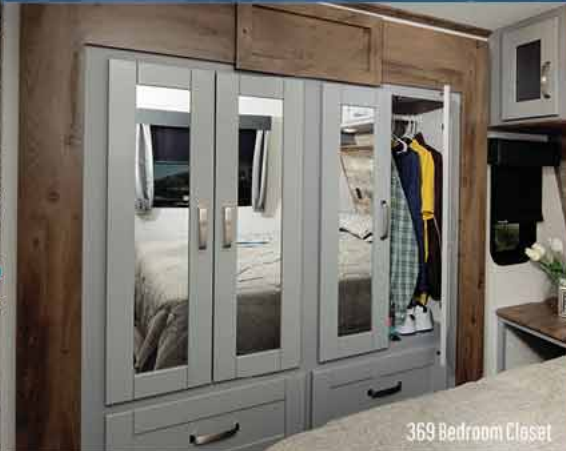
369 Bedroom Closet

Spacious, multi-use garage with upgraded sidewall protection that provides stylish durability.