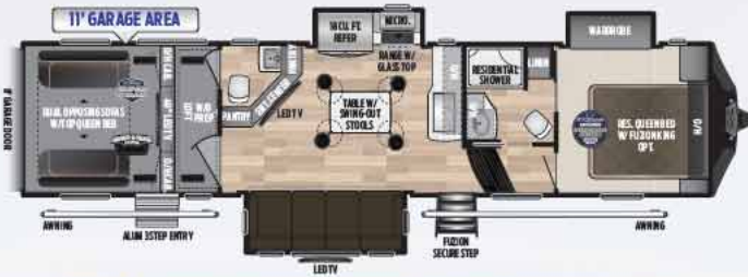
373 Island kitchen, swing out stools, 1 1/2 bath, 11' garage, tandem-axle Weight: 14054 LBS. | Length: 39' 0"