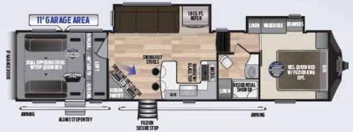
369 Bar top seating, hidden pantry, 11' garage, tandem-axle Weight: 13290 LBS. | Length: 39' 0"