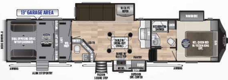
427 Island kitchen, swing out stools, 1 1/2 bath, 13' garage, triple-axle Weight: 15310 LBS. | Length: 43' 6"