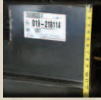
12" I-beam Construction