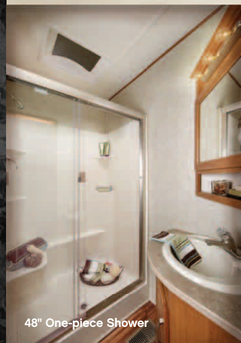
48" One-piece Shower