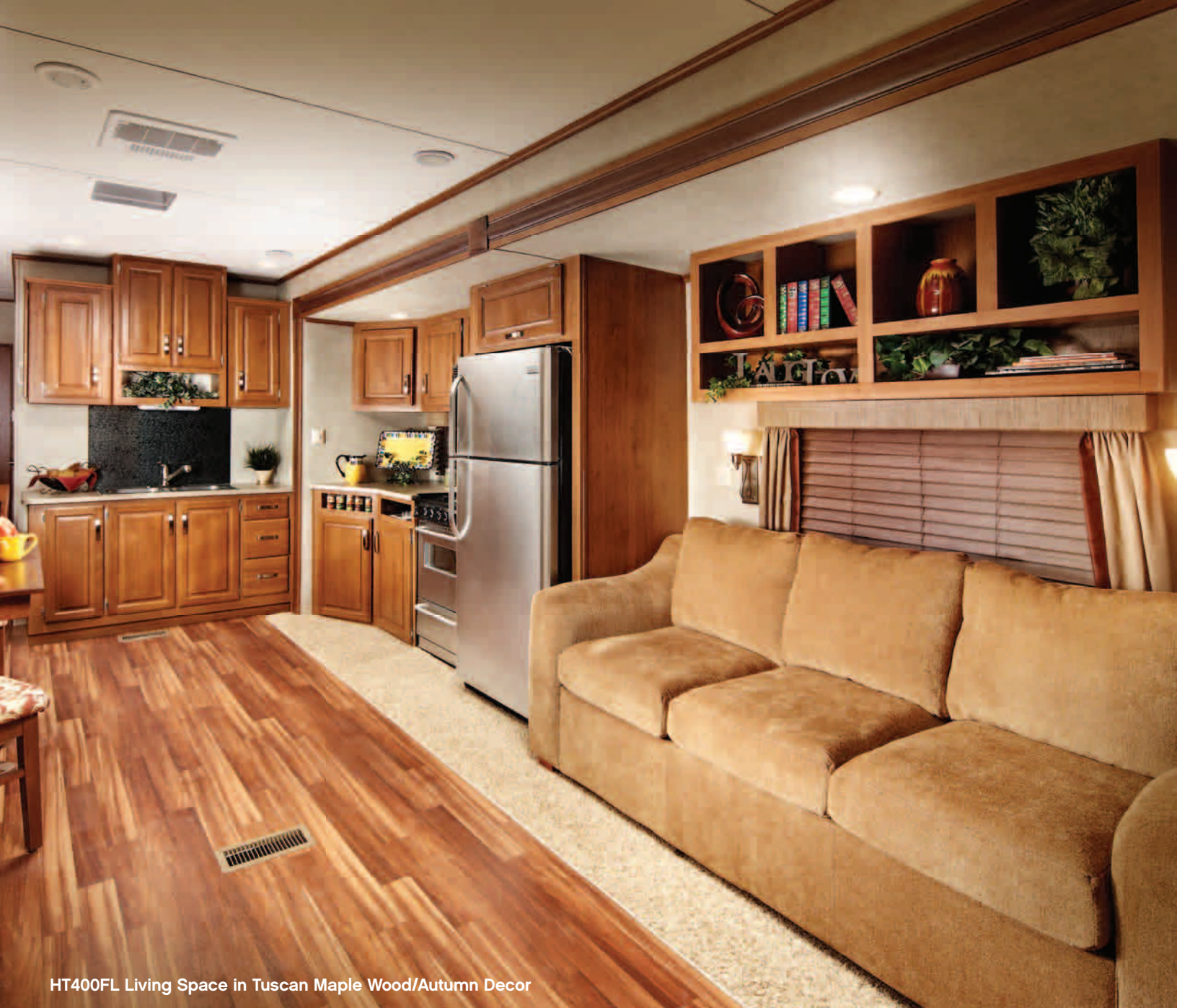
HT400FL Living Space in Tuscan Maple Wood/Autumn Decor