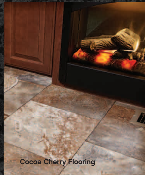
Cocoa Cherry Flooring