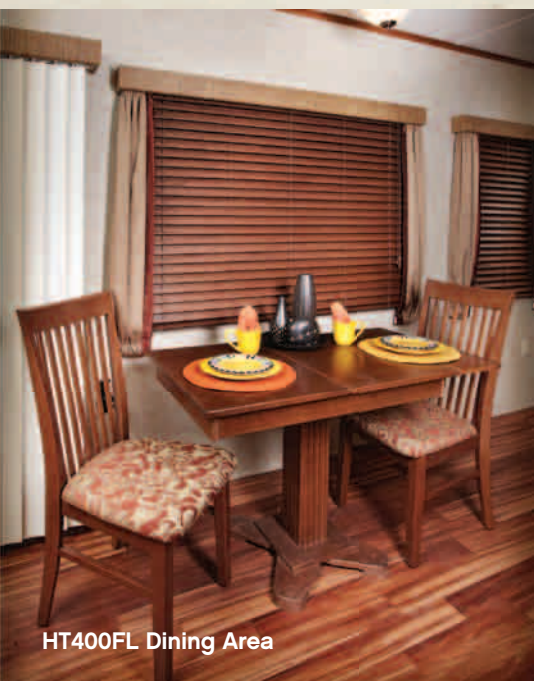
HT400FL Dining Area