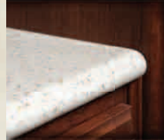
Optional Solid Surface Counters