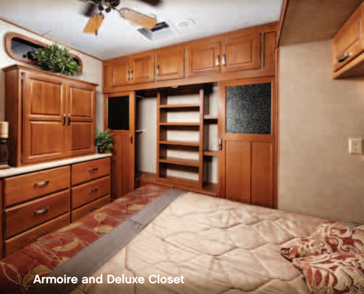
Armoire and Deluxe Closet