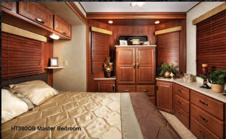
HT380QB Master Bedroom