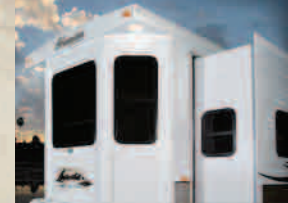
One-piece Molded Front Cap