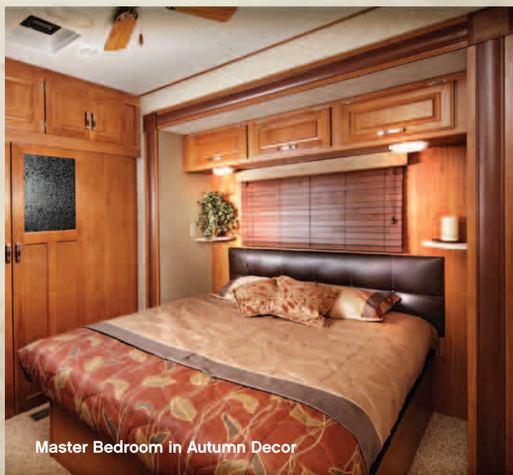
Master Bedroom in Autumn Decor

STYLE, CONVENIENCE AND PEACE OF MIND ARE DESIGNED INTO EVERY HAMPTON UNIT.