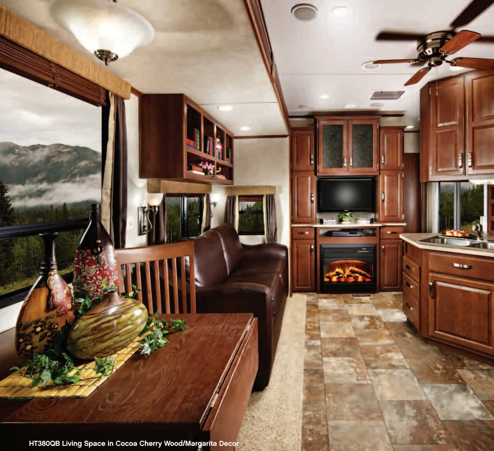
HT380QB Living Space in Cocoa Cherry Wood/Margarita Decor