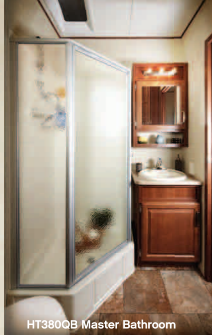
HT380QB Master Bathroom