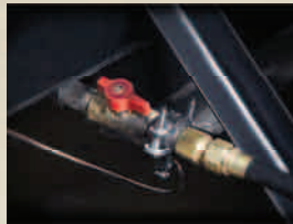
Reversible Main Shut-off