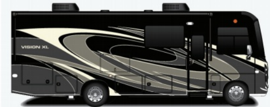
Basanite Full-Body Paint