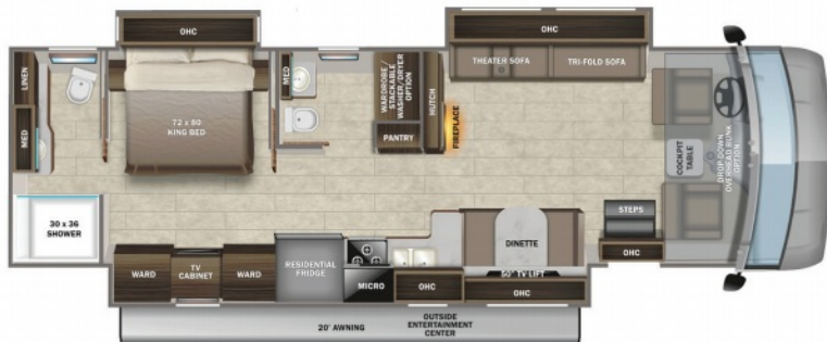
36C OPTIONS A