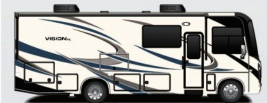
Ocean Spray Standard Graphics