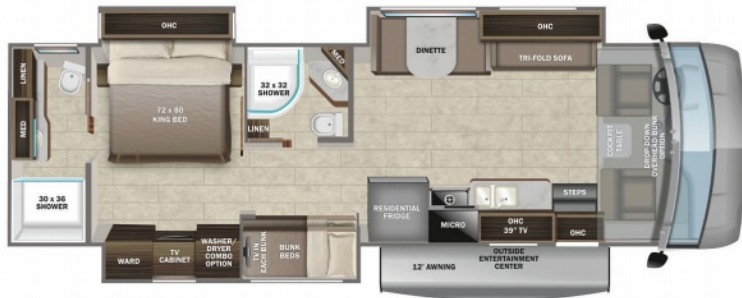
36A OPTIONS A AND C