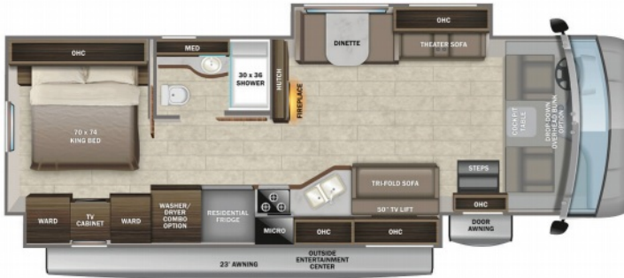
34G OPTIONS A