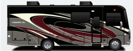
Marble Full-Body Paint