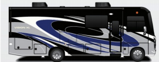
Sapphire Full-Body Paint