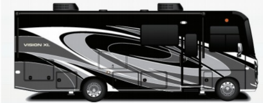
Flint Full-Body Paint