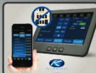
iN-COMMAND CONTROL SYSTEMS