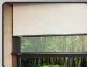
UPGRADE DAY/NIGHT ROLLER SHADES (LIVING ROOM ONLY)