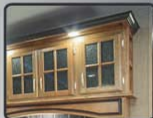
HARDWOOD CHERRY CABINET FRAMING (STILES)