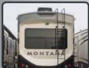
DECORATIVE FIBERGLASS REAR CAP (N/A 3790, 3791)