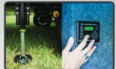
AUTO LEVELING SYSTEM