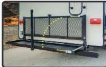
TAILGATE BIKE RACK