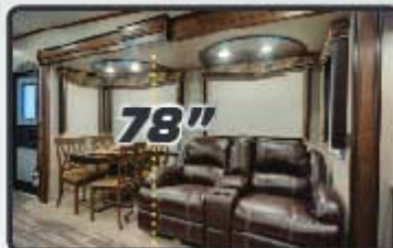
78" TALL MAIN SLIDE-OUTS W/ PANORAMIC WINDOWS