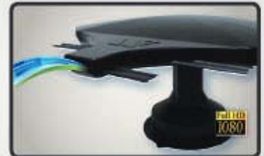
WINEGARD RAYZAR Z-1 TV ANTENNA