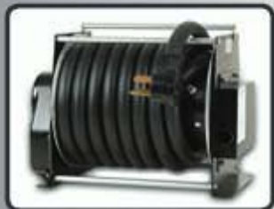
SHORELINE POWER CORD REEL (N/A 3000RE)