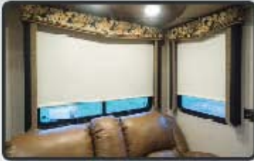
UPGRADE ROLLER SHADES