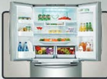
18 CU. FT. RESIDENTIAL REFRIGERATOR W/ ICE MAKER (345RL, 353RL, 375FL, 379RD)