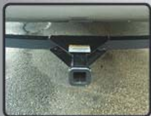
REAR ACCESSORY HITCH