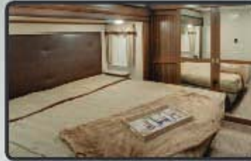
KING SIZE BED (N/A 362RD, 380/381TH)