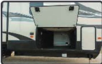
DROP FRAME CONSTRUCTION WITH MASSIVE STORAGE