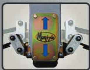
EXCLUSIVE MOR/RYDE 4100 SUSPENSION SYSTEM W/ WET BOLTS