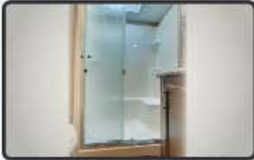
SEAMLESS 48"X30" FIBERGLASS SHOWER W/ SEAT