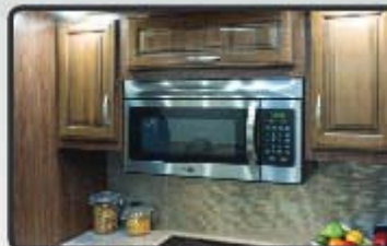
TRUE 30" RESIDENTIAL MICROWAVE