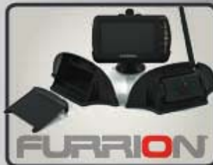
WIRELESS REAR VIEW CAMERA SYSTEM