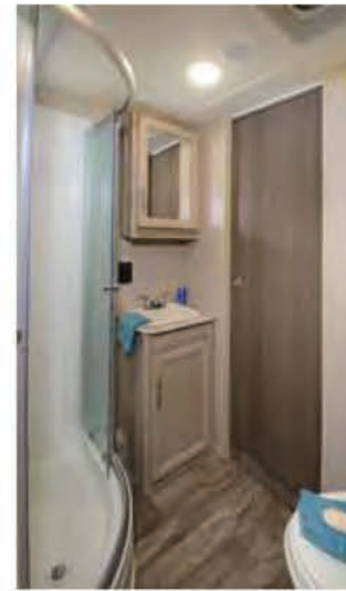
Tired of small bathrooms? That is something you don't have to worry about in the 333RETS. A full-sized radius shower that includes tub surround and skylight, dual entrances, large sink, and medicine cabinets provide all the convenience you could ask for.