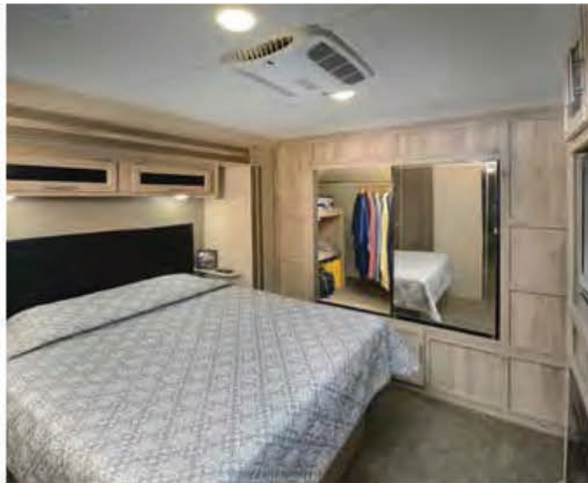
The 333RETS bedroom is built with a slide out making it one of the most spacious bedrooms in any travel trailer.

Wow! That's the first word that comes to mind when you step in to the Catalina 333RETS. Designed with a huge living and kitchen area to make your camping trips the ultimate experience! With an oversized bedroom, giant wardrobe, standard recliners, extra-large living room, and much more, you can't help but say wow!