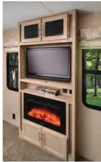
This bedroom also includes a custom built entertainment center and a fireplace. You'll feel right at home when you're ready to call it a night!