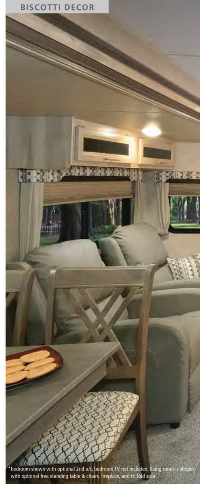
*bedroom shown with optional 2nd a/c, bedroom TV not included, living room is shown with optional free standing table & chairs, fireplace, and tri fold sofa