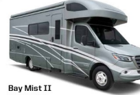
Bay Mist II