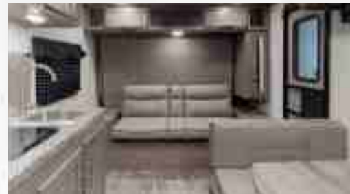
186BH Murphy Bed