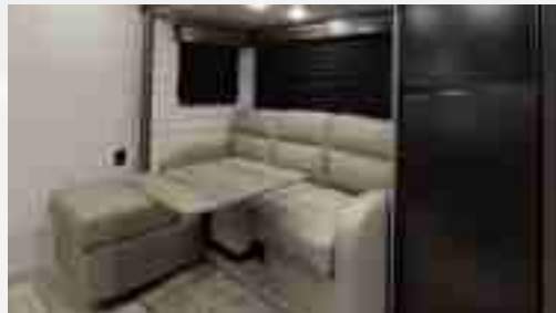
212RB Chaise Lounge