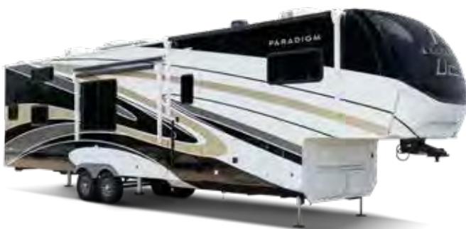
Full Body Paint Option Gold