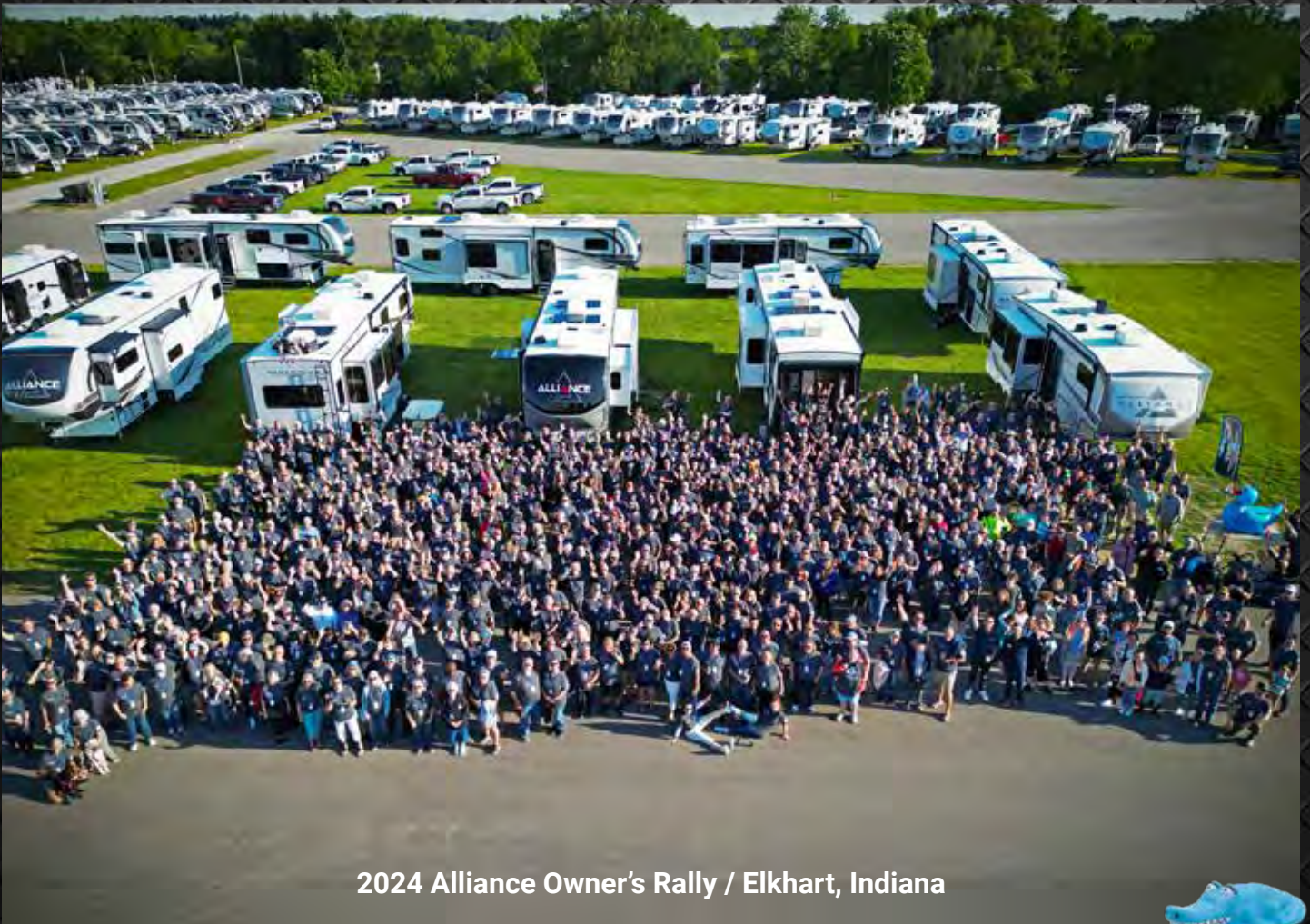
2024 Alliance Owner's Rally / Elkhart, Indiana