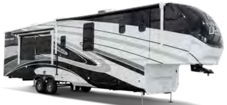
Full Body Paint Option Black