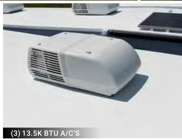
(3) 13.5K BTU A/C'S