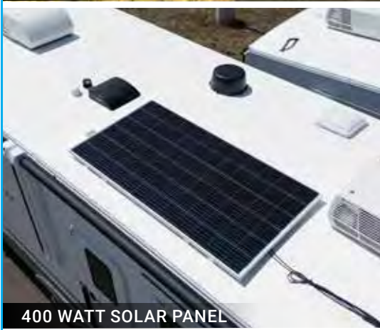
400 WATT SOLAR PANEL