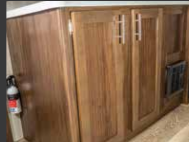
Solid Wood Cabinet Doors