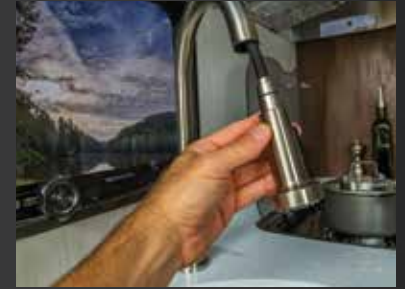
Residential Pullout Faucet