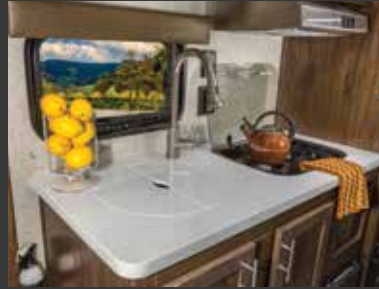
LG Solid Surface Countertop