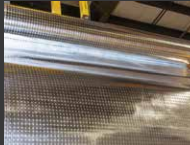
Thermo-Foil Arctic Insulation