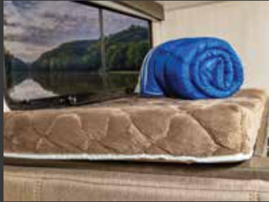
Oversized Bunk Pads