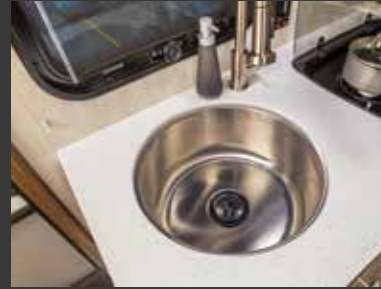
Deep Stainless Steel Sink