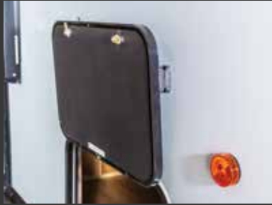
Hands Free Baggage Door Catch