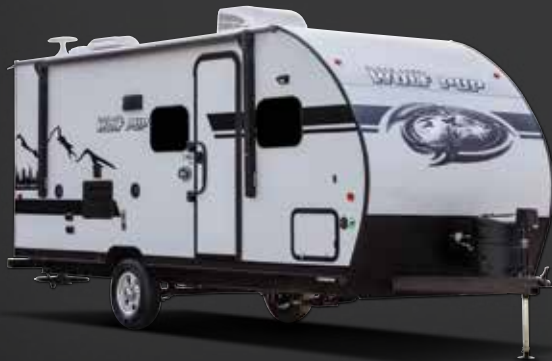
Wolf Pup Black Label Edition Exterior Gel Coated Fiberglass, Power Tongue Jack, Aluminum Rims