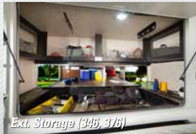
Ext. Storage (346, 376)