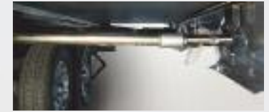
PlatTform™ slide-out floors are moisture resistant