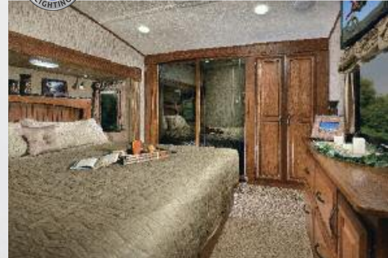
34 CK05-6 All Sabre fifth wheels feature washer/dryer prep in bedroom, a hardwood dresser with full extension drawer glides and no step bedroom access. Shown in Mink décor.