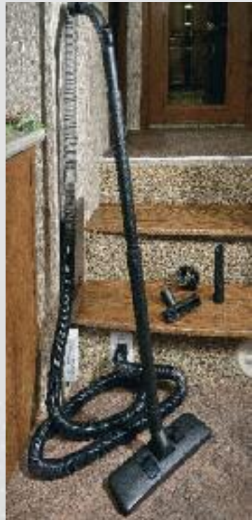
Optional Eureka Central Vacuum System