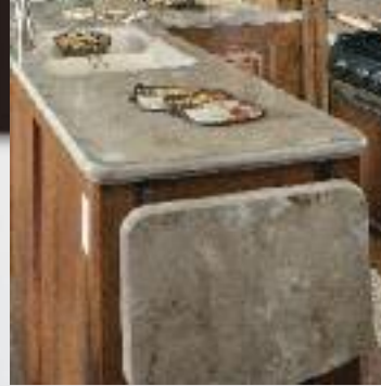
Optional LG Solid Surface countertop, sink lids and backsplash with goose neck pull out sprayer and under mount Stonecast sink