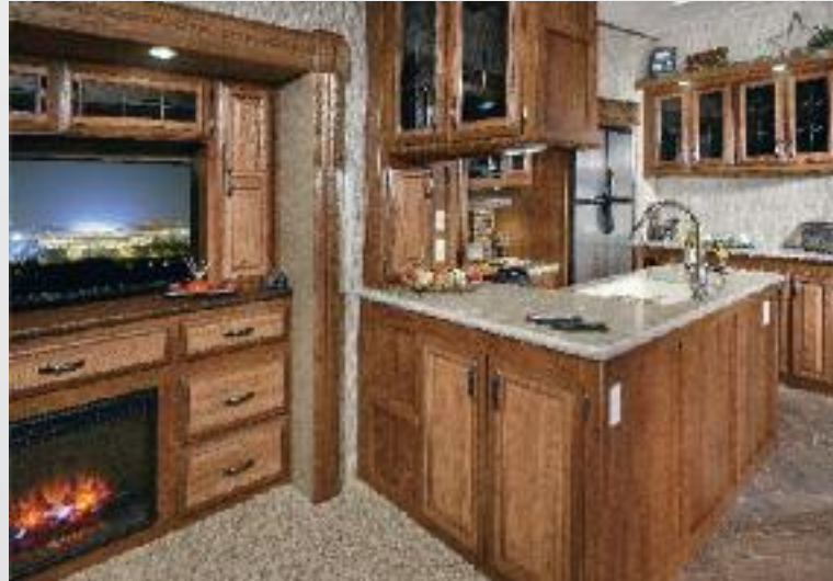
34 CK05-6 This spacious kitchen has plenty of counter space and storage plus, a standard 39" TV and 12 Volt CD/DVD/AM/FM player with 5.1 surround sound. Options shown include a stainless steel appliance package, a 12 cu. ft. refrigerator, LG solid surface countertops with a goose neck pull-out faucet and electric fireplace.