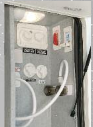
Exterior convenience center includes Within Reach water heater bypass valve, E-Z winterize valve, hot and cold exterior shower, black tank flush, 110V outlet plus cable and satellite hook-up