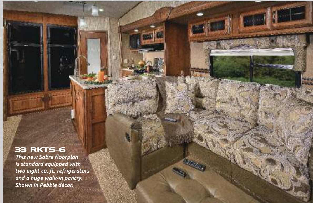
33 RKTS-6 This new Sabre floorplan is standard equipped with two eight cu. ft. refrigerators and a huge walk-in pantry. Shown in Pebble décor.