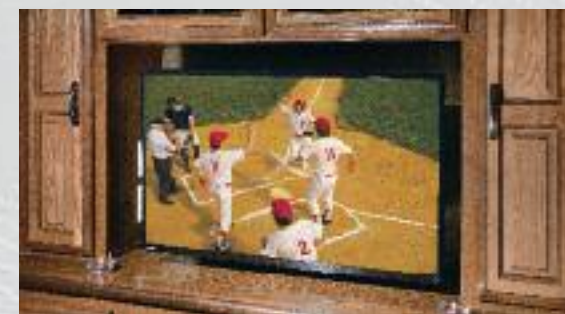
39" HD LCD TV, CD/DVD/AM/FM/player with 5.1 Dolby surround sound and Blue Tooth technology