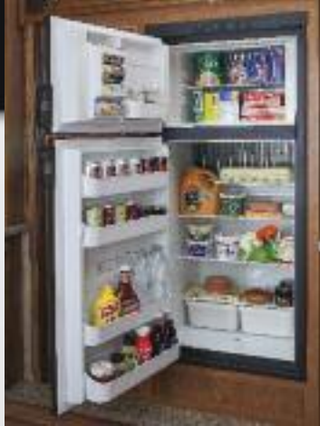
Eight cu. ft. Dometic® refrigerator