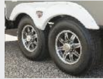
Steel belted radial tires shown with optional aluminum wheels