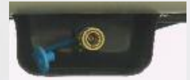
LP quick disconnect