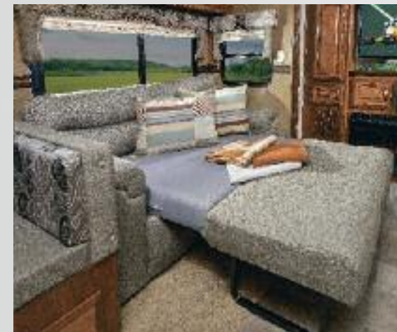
Optional tri-fold sofa

36 QS2B-7 Comes complete with arched ceilings, a 39" TV and 12 Volt CD/DVD/AM/FM player with 5.1 surround sound. Options include LG solid surface countertops, a ceiling fan and an electric fireplace. Shown in Pewter décor.