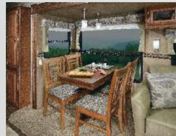
Optional free standing dinette with leaf extension and flip-up storage (Standard on some models.)