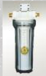
Whole system water filtration