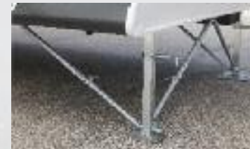
Optional JT's strong arm jack stabilizers