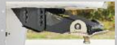
Optional Trailair Rota Flex rubberized pinbox