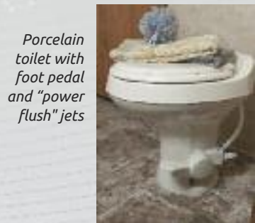
Porcelain toilet with foot pedal and "power flush" jets