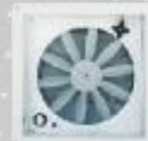
12" Fantastic® fan