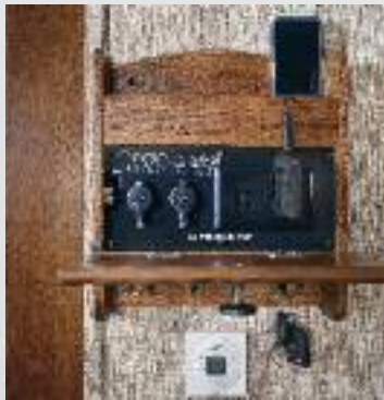
Cell phone charging/organizer station