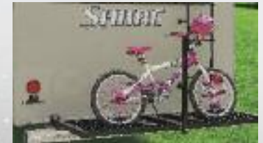
Optional flip-down bike/utility rack