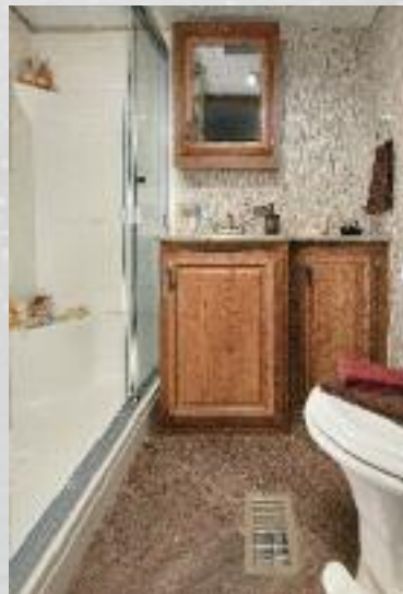
34 CK05-6 Sabre bathrooms have a large bathroom sink with cover, soap dish and tooth brush holder. Options shown include a 48" x 30" fiberglass shower with built-in seat and a three piece glass door.