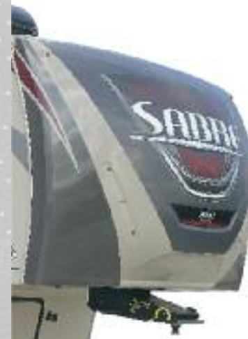
Aerodynamic fiberglass front cap with LED hitch pin and marker lights