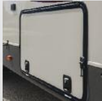
Slam-latch luggage door shown on coach with Platinum Edition option