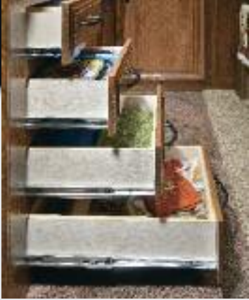
Full extension drawers