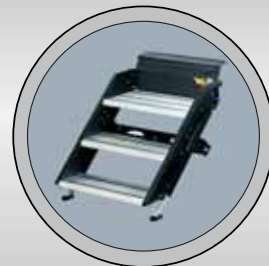
"SOLID STANCE" FOLD-DOWN STEPS