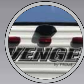
BACK UP CAMERA PREP