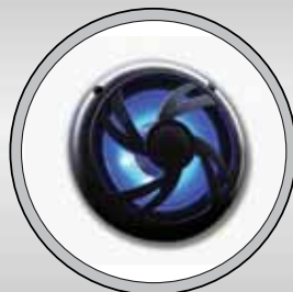
BLUE LED LIT OUTDOOR SPEAKERS