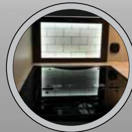
LED LIT KITCHEN BACKSPLASH