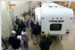
Executive Quality Audits