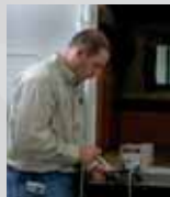
65 Point Secondary PDI