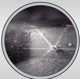
BLACK TANK FLUSH (N/A ATI)