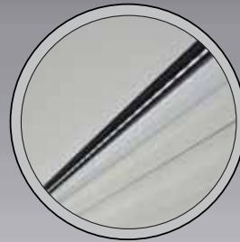
LED LIT POWER AWNING