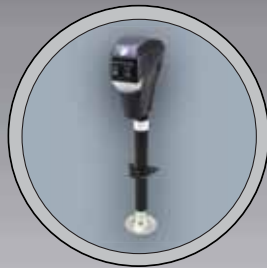
ELECTRIC TONGUE JACK (N/A ATI)