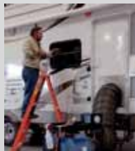
Seal Tech Air Pressure Test