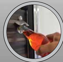
EXTERIOR BOTTLE OPENER