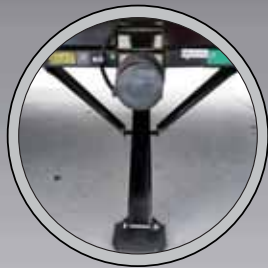
ELECTRIC STABILIZER JACKS (N/A ATI)