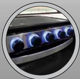
GLASS TOP STOVE WITH LED LIGHTING