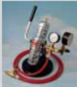
Seek-A-Leak Pressure Test

Prime Time Manufacturing is proud to be recognized as an industry leader in value, reliability, and overall quality by the Recreational Vehicle Dealers Association. We are committed to "A Higher Standard" in design, construction, testing, and customer service. Check us out – we know you'll be impressed!