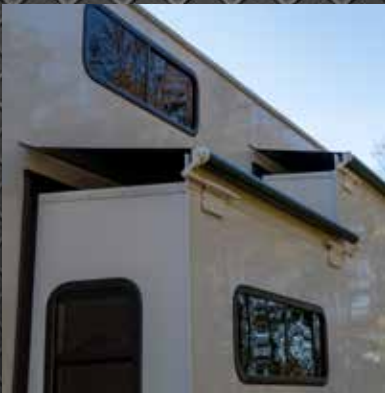
Slide topper awnings