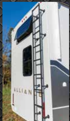
Oversized aluminum ladder